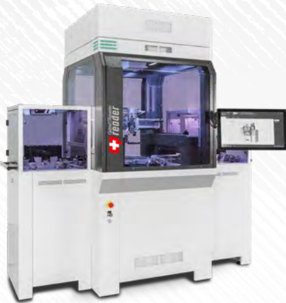
CP Optical Character Reader Cell